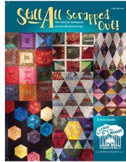
STILL ALL SCRAPPED OUT!