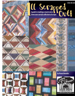
ALL SCRAPPED OUT!